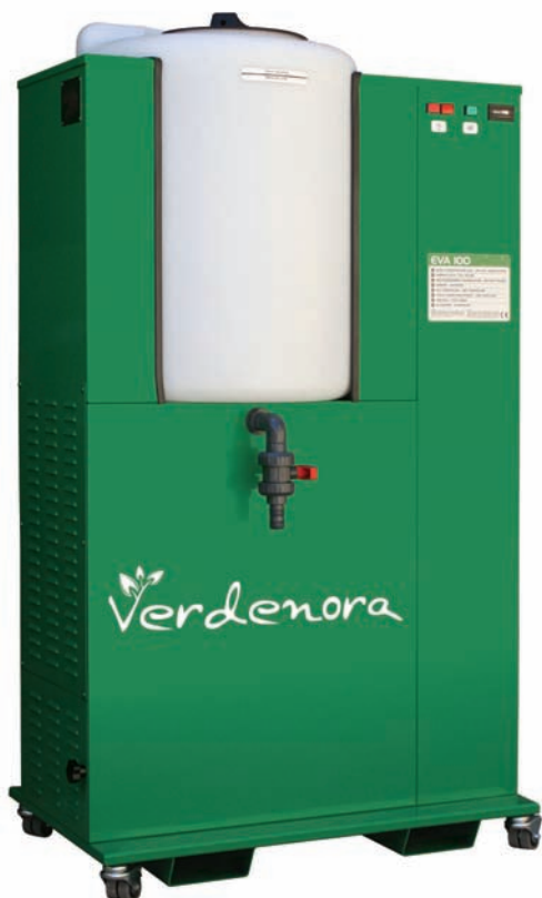
EVA™ 100 batch line